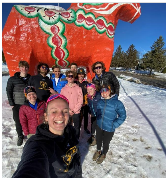
Above: The CSO Men and Women again won the day in Mora.

2022 saw the College of St. Olaf erect an 'Orange Wall' in Mora – locking down the Dala standings to propel both their Men's and Women's teams onto the Collegiate Cup podium. Although some fifty degrees warmer than last year's race, history repeated itself this Saturday, with commanding performances in the Dala again allowing both the CSO Men and Women to win the day. Racing only in the Dala, the Ole Men captured 213 points – more than any other MCSA team, ever. With strong performances in the Vasa, the University of Minnesota-Duluth Men were second for the day, with 198 points. Collecting substantial points from both events were the University of Minnesota-Twin Cities Men , taking third with 174 points.